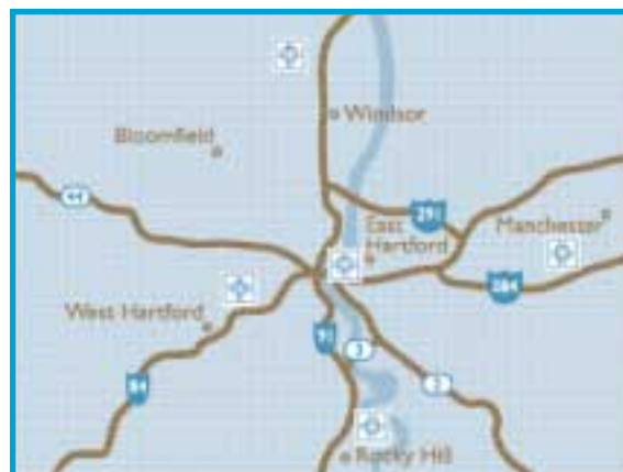
If you need directions from where you live, please call

EAST HARTFORD MEDICAL OFFICE 99 Ash Street • East Hartford, CT 06108 8:30am-7:30pm M-F • 8:30am-4:00pm Sa, Su Behavioral Health • Dermatology • Internal Medicine Lab Services • Mammography • Ob/Gyn • Pediatrics • Pharmacy Physical Therapy • Radiology/X-ray • Ultrasound • Urgent Care